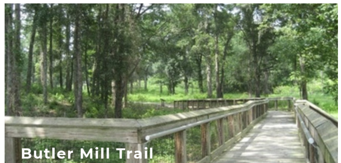
Butler Mill Trail

Take an engaging trek through historic plantation grounds, ceremonial mounds, and changing terrain on the Butler Mill Trail, located at Lake Jackson Mounds State Park.