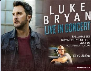
LUKE BRYAN JULY 23

Barb's Gourmet Brittles: From standard peanut to almond, cashew, pecan, macadamia and pistachio, nearly the whole nut family is incorporated into the sweet brittles. BarbsBrittles.com