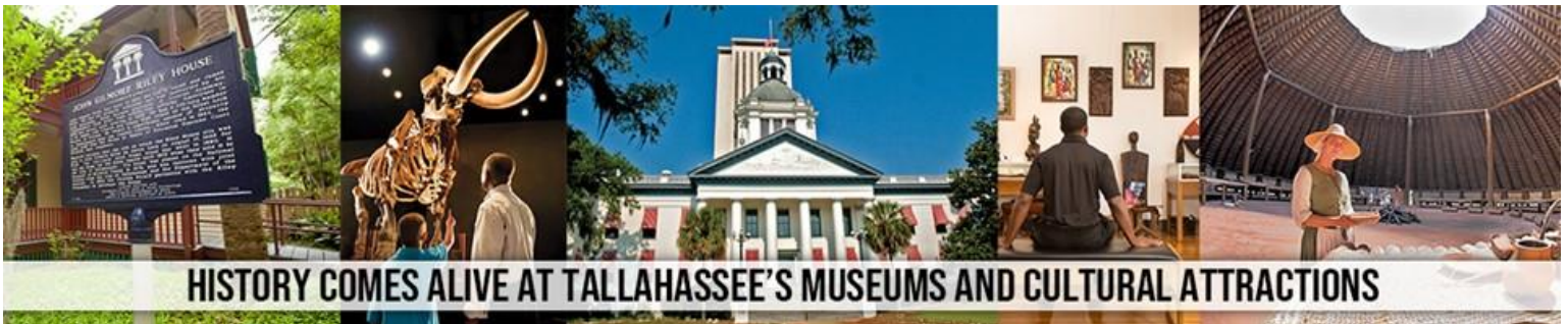
HISTORY COMES ALIVE AT TALLAHASSEE'S MUSEUMS AND CULTURAL ATTRACTIONS