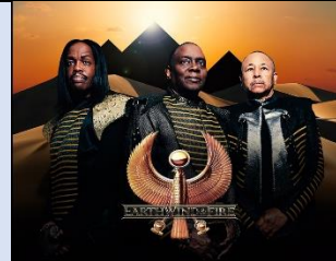
EARTH, WIND & FIRE SEPT 21