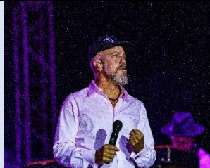
JJ GREY & MOFRO SEPT 9