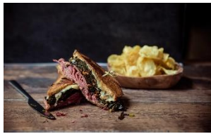
Table 23: This "Southern porch, table, and bar" in Midtown serves lunch, dinner, Sunday brunch, fabulous cocktails and craft beers. Table23Tally.com

For a Full List of Tallahassee Restaurants, go to VisitTallahassee.com