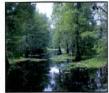
Lake Lamonia near Tall Timbers