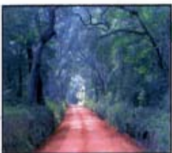
Twelve Mile Post Road